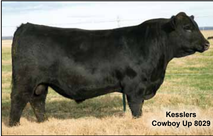
Kesslers Cowboy Up 8029