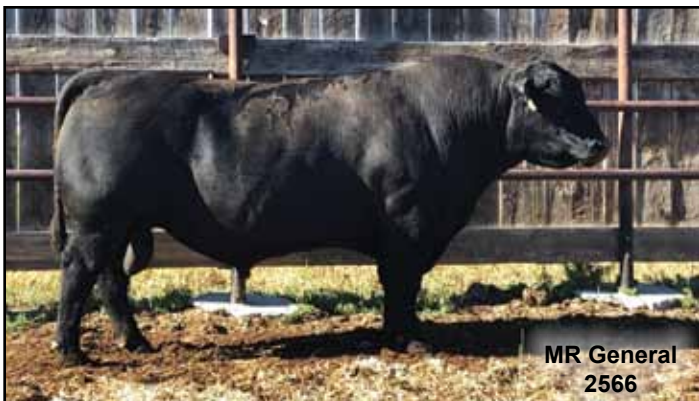
MR General 2566