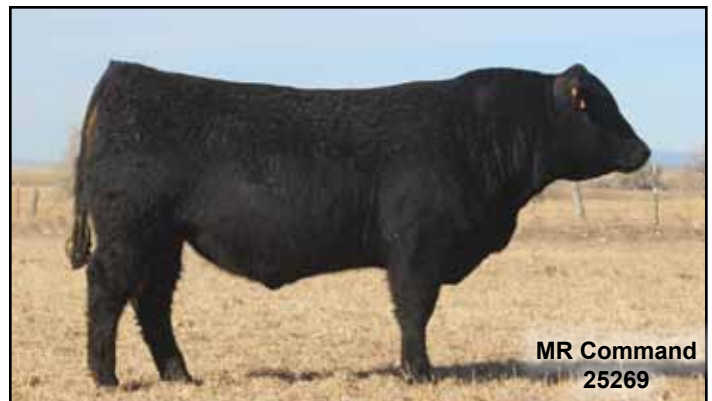
MR Command 25269