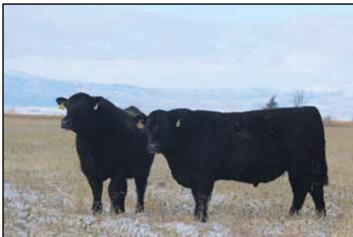
Angus Bull Sale