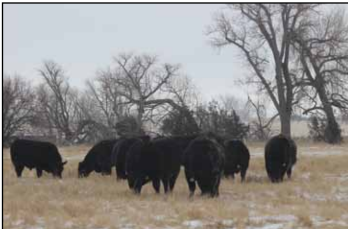
Angus Bull Sale