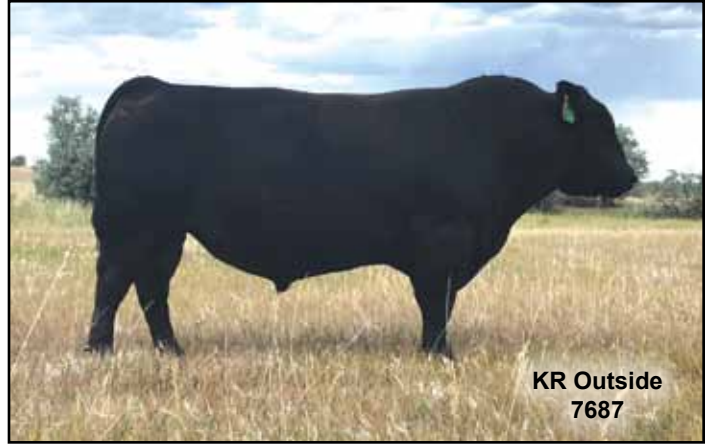
KR Outside 7687